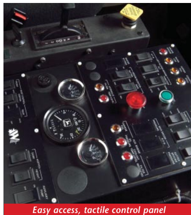
Easy access, tactile control panel

The control console, located between the operator stations, provides quick, easy access. All sweep function switches have tactile-feel surfaces, so operators can work the panel while keeping their eyes forward, for added safety and efficiency.