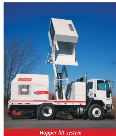
Hopper lift system

The Road Wizard's large hopper features a double-scissors lifting mechanism that is center-mounted for greater stability, rigidity and trouble-free operation. Plus, its dumping height is adjustable up to 11-feet.